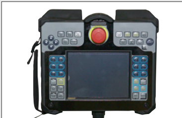
EXPLOSION PROOF TEACH PENDANT (OPTIONAL)