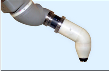
HOLLOW WRIST WITH BELL APPLICATOR (EXAMPLE)